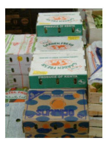
Produce from Kenya ready for shipment, locally or worldwide.

Other assistance ranges from energy services to sustainable tourism. The South Asia Regional Initiative includes an energy component that promotes mutually beneficial energy linkages among the nations of South Asia. The program promotes an understanding of the benefits of regional energy trade and builds capacity for energy trading opportunities. In Ecuador, technical assistance and training supports local-based ecotourism as a productive alternative to overfishing, enhances local governance, and promotes a marine zoning plan.