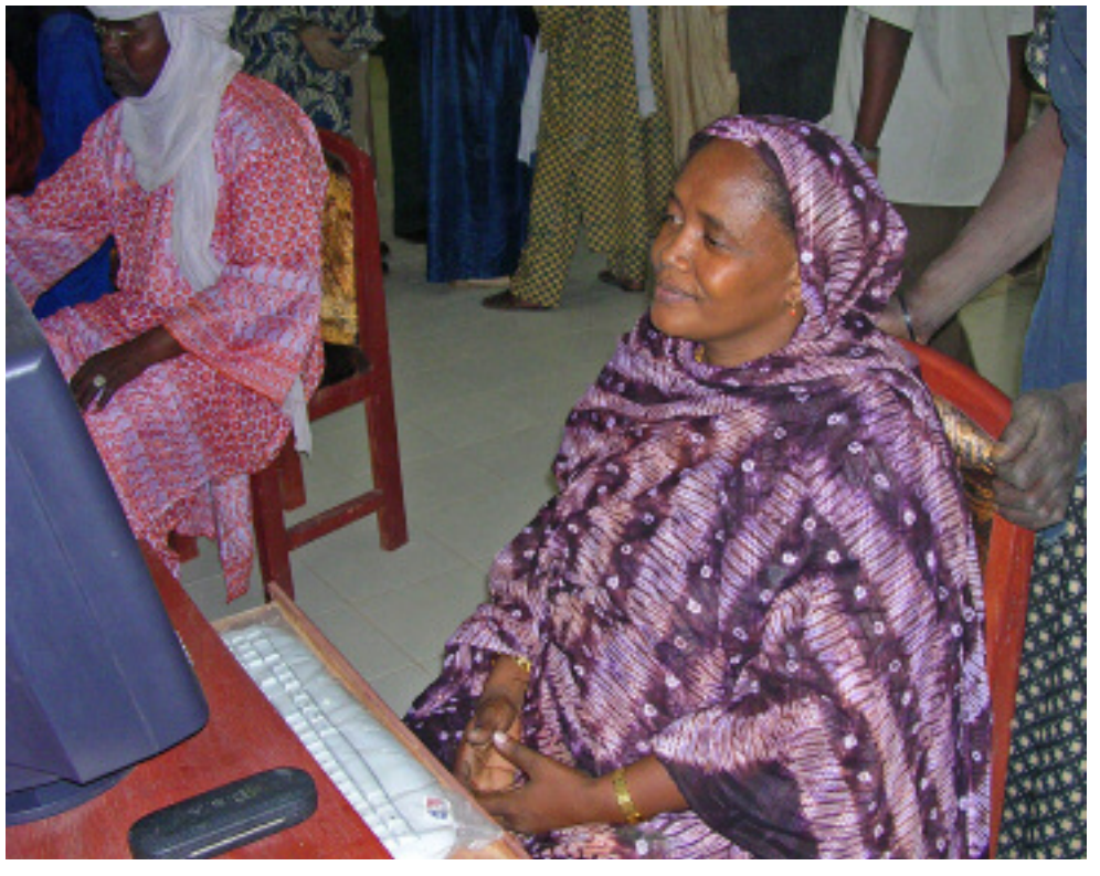
Clients using a Community Information Center in Mali.

The U.S. bilateral TCB assistance to LDCs participating in the IF process has risen from $36.6 million in 2001 to over $132.9 million in 2005. This is supplemented by U.S. contributions to the IF trust fund and to related programs of the International Trade Centre in Geneva.