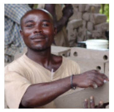
In Uganda, TCB helps small businesses grow.

Director, Department of Commerce and Competition October 7, 2005