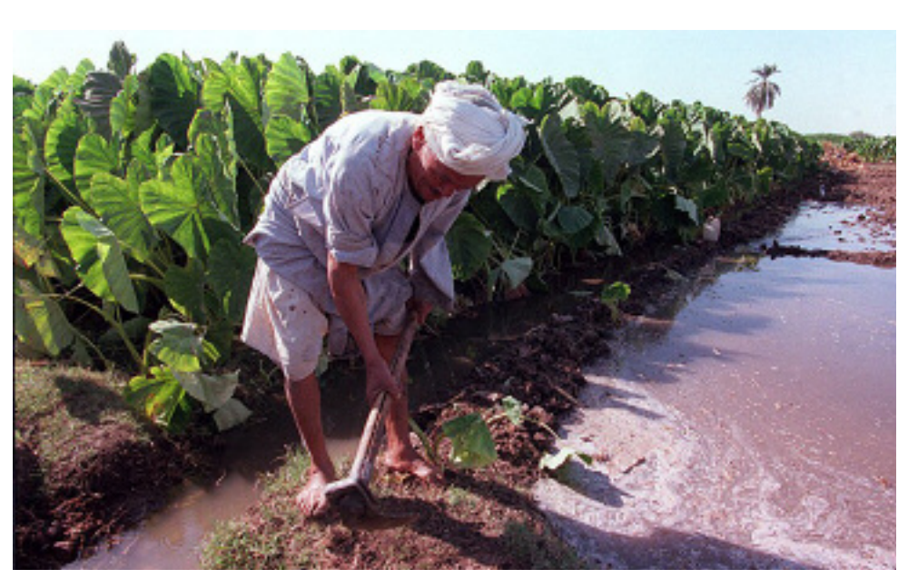
Improving productivity of the agriculture sector in Egypt.

Economic growth, trade expansion, and increased income-earning opportunities in developing countries are often linked to the agriculture sector. Trade-related standards, changing consumer preferences, and international advancements in science and technology are important factors