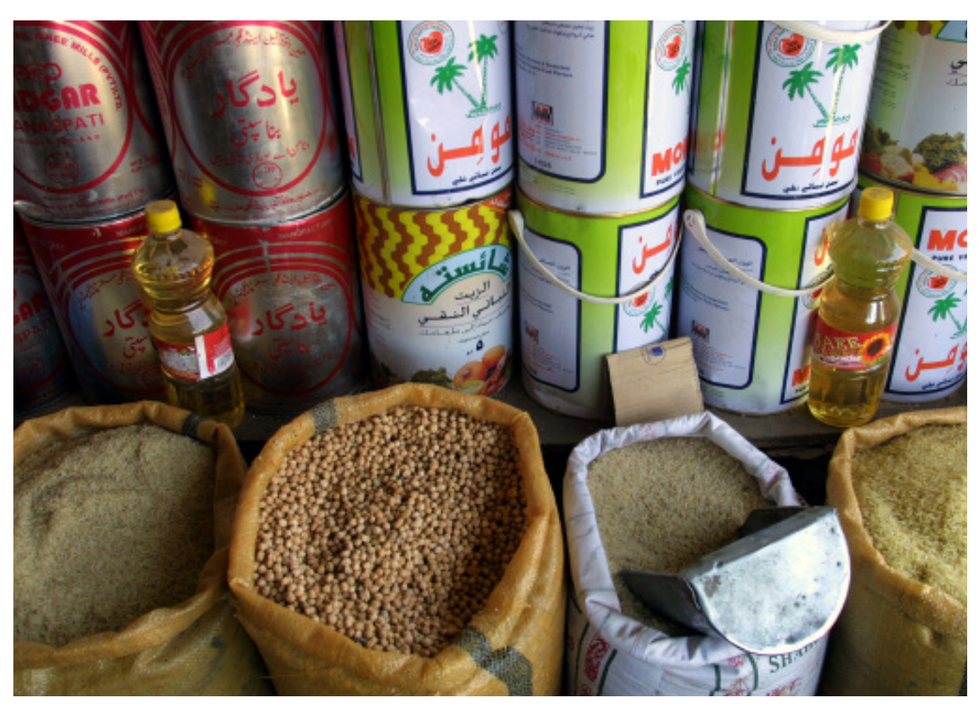
Grain at a market in Afghanistan.

provided WTO accession and implementation services to Nepal, which officially became a WTO member in 2003, and Cape Verde and Saudi Arabia. Ukraine and a number of other countries in Eastern Europe and the former Soviet Union also have benefited from U.S. support in this area. In 2004, USAID responded to Ethiopia's request for assistance in its accession process by initiating a major, three-year project. The United States provided broad accession support in 2004 to Iraq and Afghanistan.