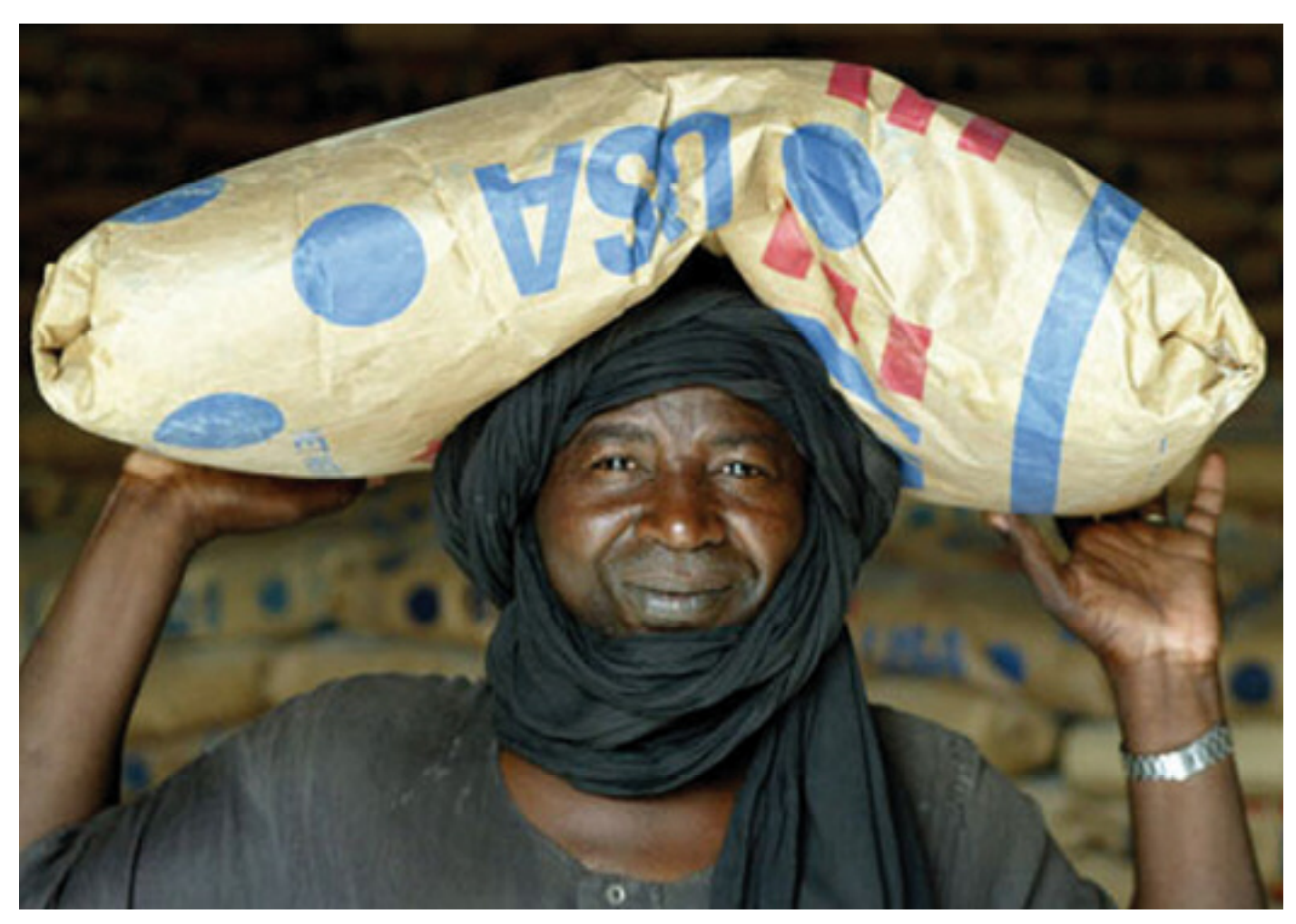
U.S. regional programs in West Africa support local populations.

In Monterrey, Mexico, President George W. Bush called for a new compact for global development to link greater contributions from developed nations to greater responsibility from developing nations. In response, the United States established the MCC in 2004 to work with some of the