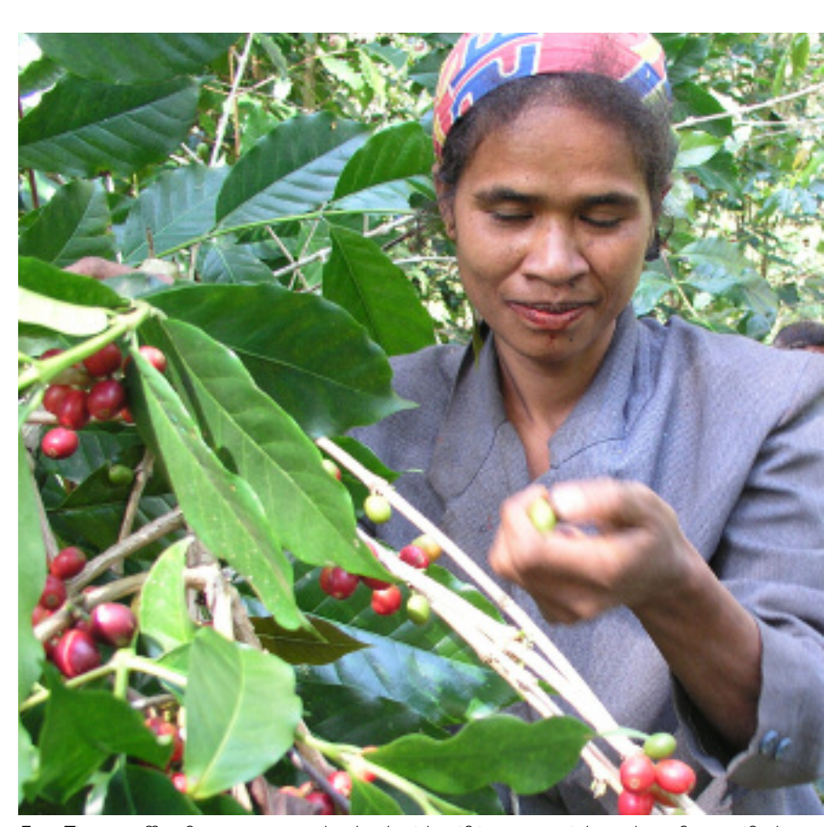
East Timor coffee farmers expand sales by identifying potential markets for certified organic coffee.

The United States is the largest single-country donor of TCB assistance, providing over $1.34 billion in 2005, up from $921.2 million in 2004. The United States' Millennium Challenge Account (MCA) contributed to TCB funding for the first time this year, complementing ongoing U.S. programs. In addition, we continue our strong support for the trade-related programs of the multilateral